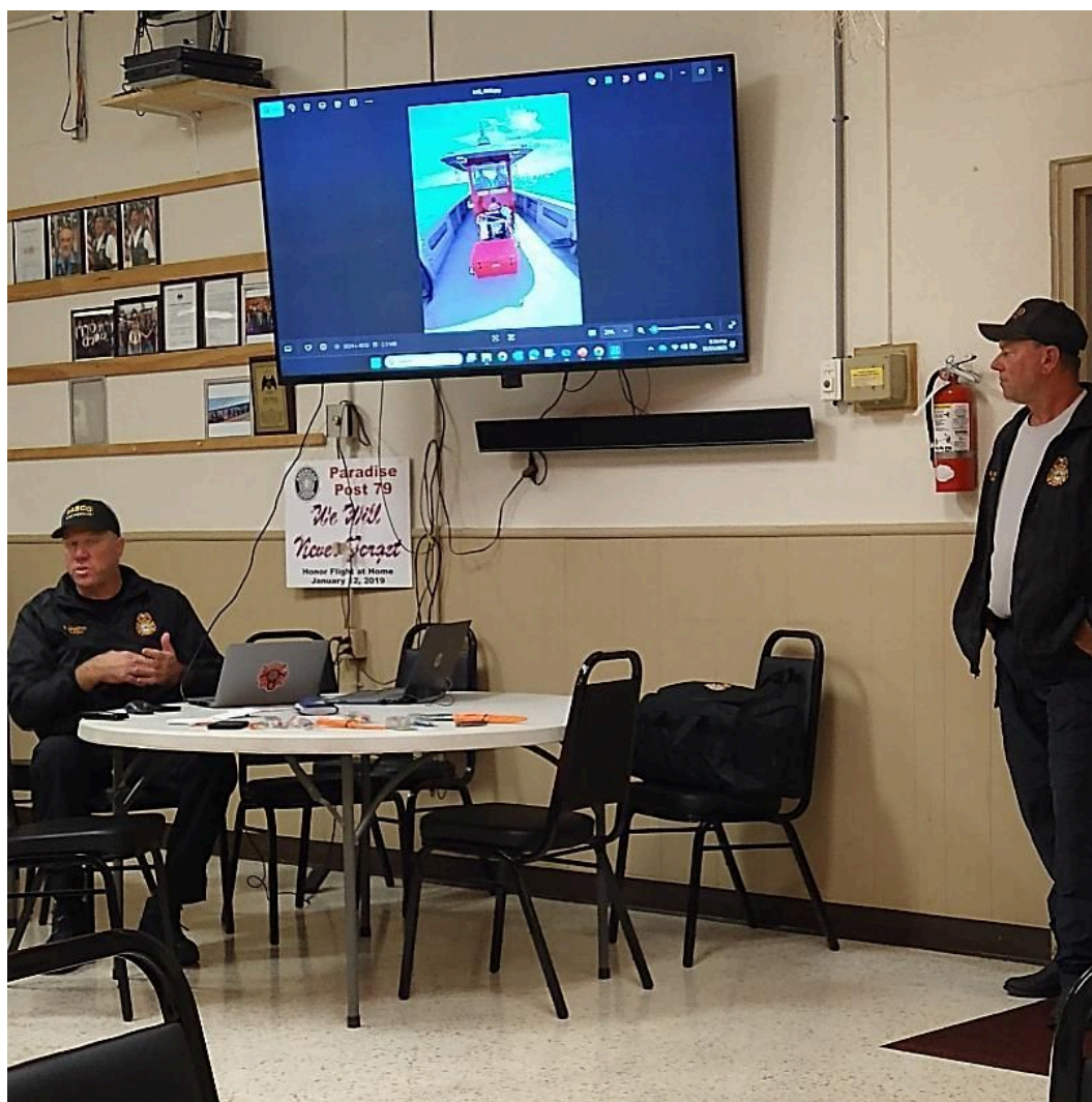
Captains in action leading discussion.